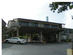
Large meeting rooms location

The first evening was spent together with registration and fellowship, followed by business meetings to get things started off.