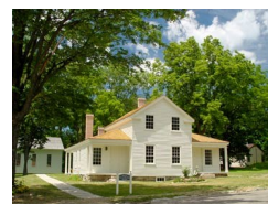
James & Ellen White Home

7:30 Breakfast 8:15 Leave for Battle Creek Tabernacle for Church 12:30 Lunch at Church 1:00 Tour of Adventist Historical Village and Pioneer Cemetery (Oakhill) 6:00 Supper in Holland 8:45 Vespers at the beach (weather permitting) 9:30 Ice Cream