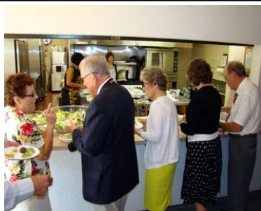
Food line after church Sabbath

Please contact Madeline Torres at mtorres@guamsda.com or call Cell # 808-599-0566 or by emailing hr@guamsda.com . You can also visit our website at www.adventistclinic.com . God bless!