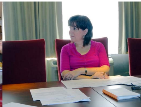
Business meeting President